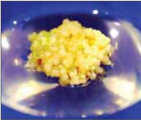
Banana meristem, before freezing

act as an amino acid source they may be too degraded."